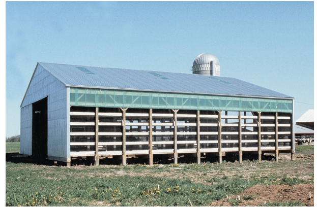
Wolmanized® CCA Heavy Duty™ wood is an ideal structural material for today's farmers and ranchers in post frame construction as well as in the construction of pole barns.